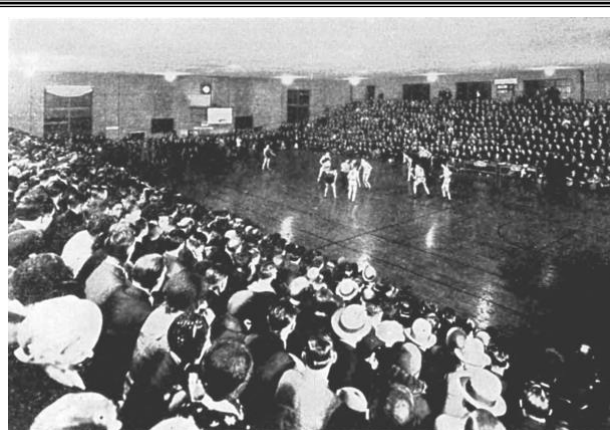
THE FINALS AT HASTINGS